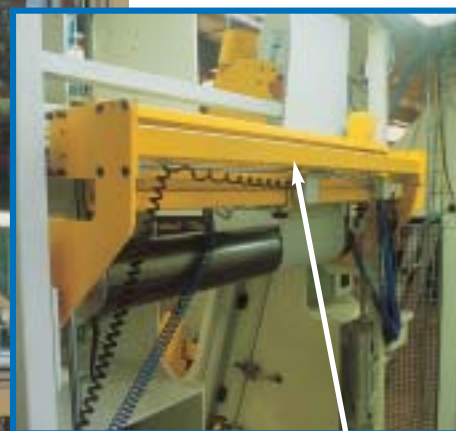
Table in jointing position